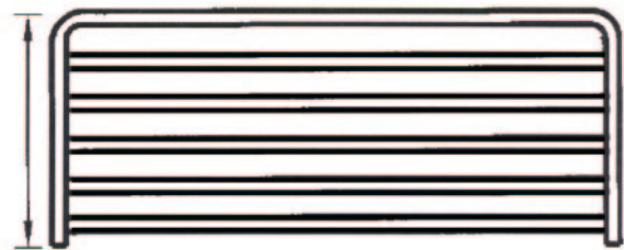
Bar Type Sheep Gate